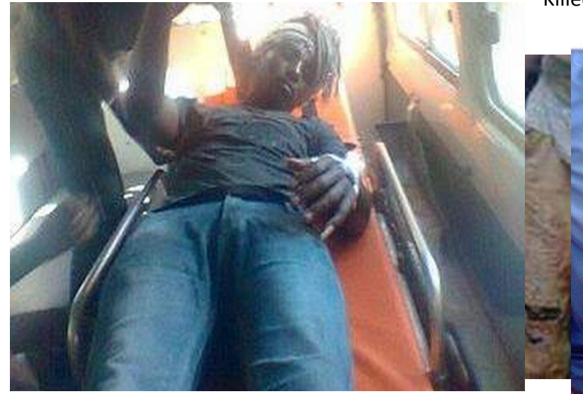
Killed and wounded Oromo Students